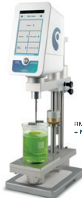
RM 100 CP 1000 + MS-KREBS

MS CP (p80), MS-RV (p75)*, MS-VANES (p77)*, MS-KREBS (p77)*, (* with adaptor Ref. 800146).